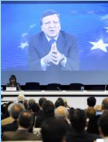
José Manuel Barroso